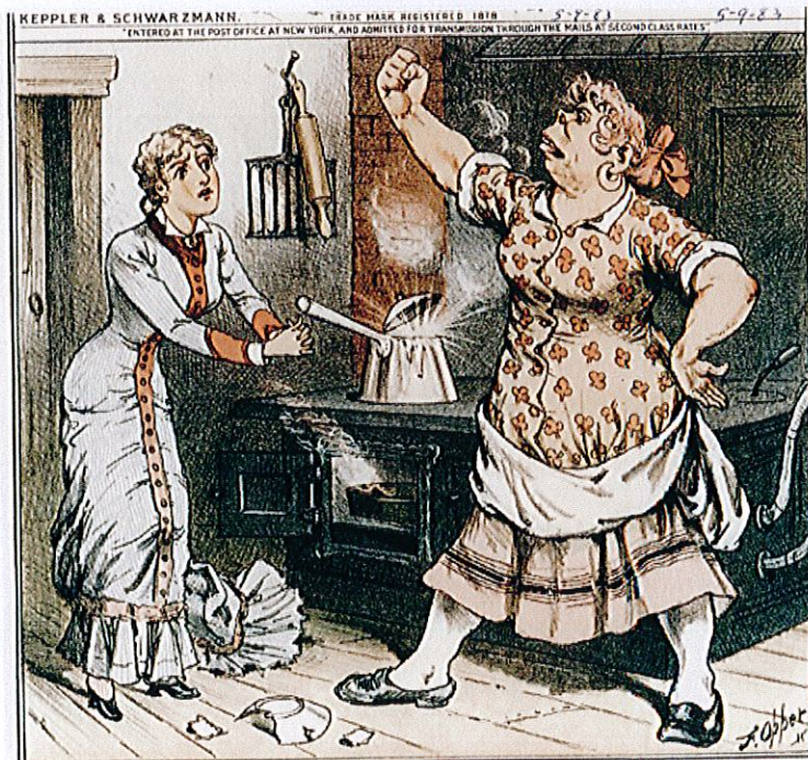
THE IRISH DECLARATION OF INDEPENDENCE THAT WE ARE ALL FAMILIAR WITH.